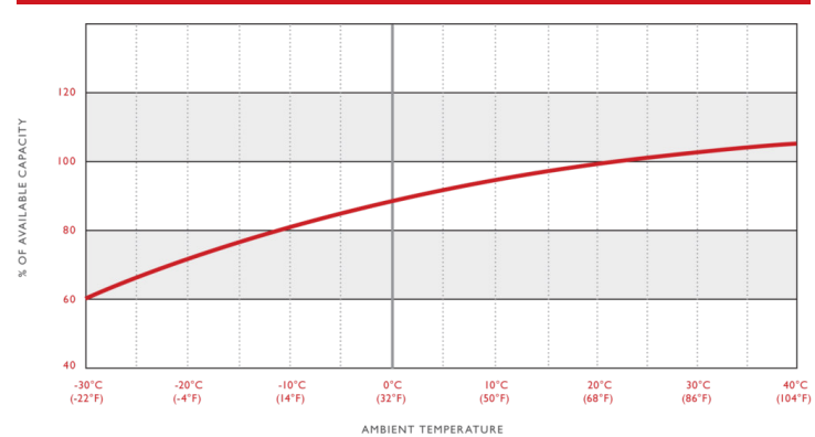
Rev.#3 | May 2018